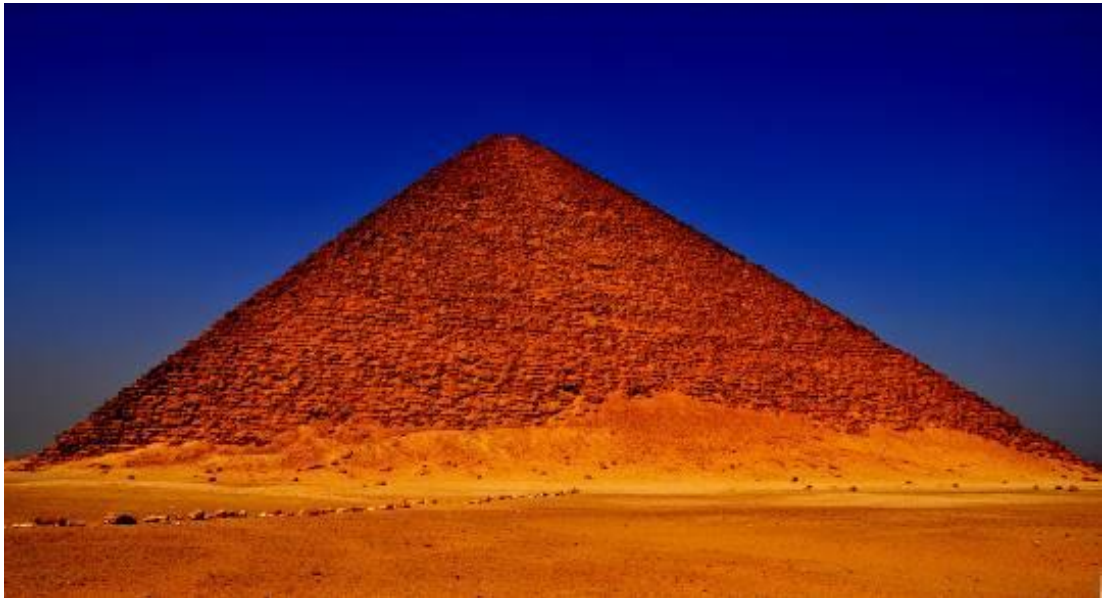
Red pyramid in Dahshur