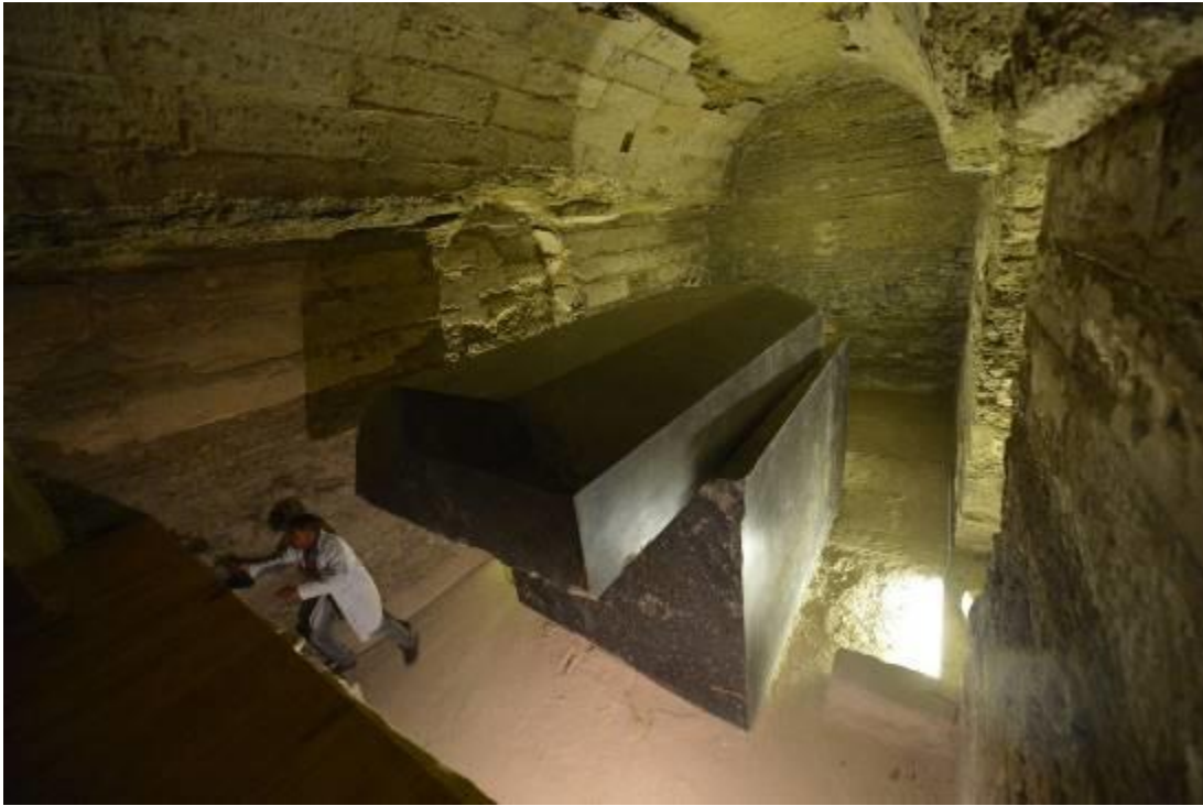
Mysterious Serapeum of Sakkara