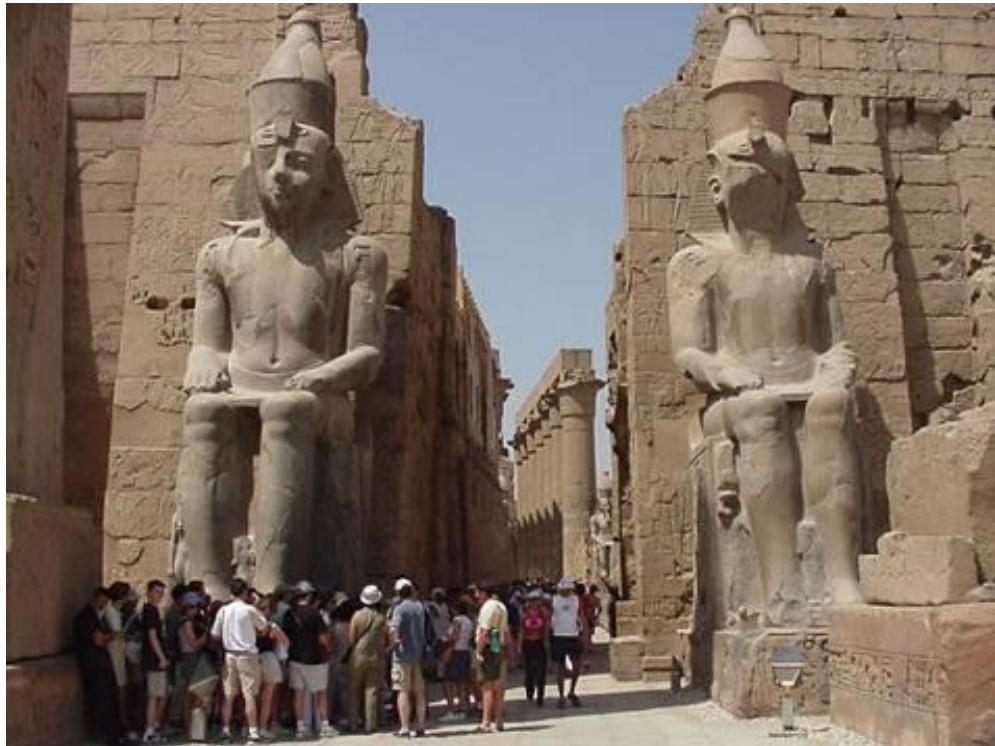
Luxor (rejuvenation) Temple