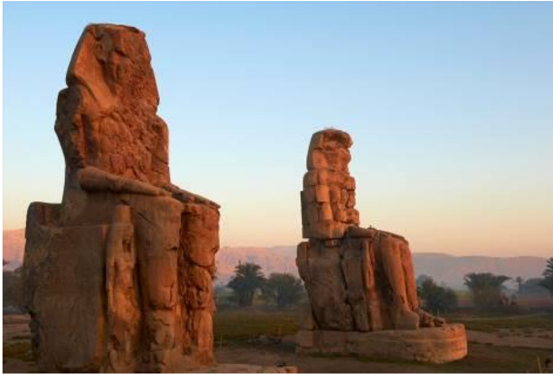
Colossi of Memnon