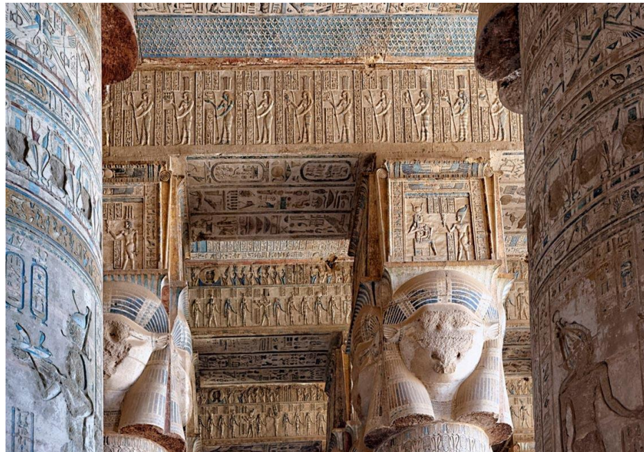
Temple of Hathor, Goddess of Love