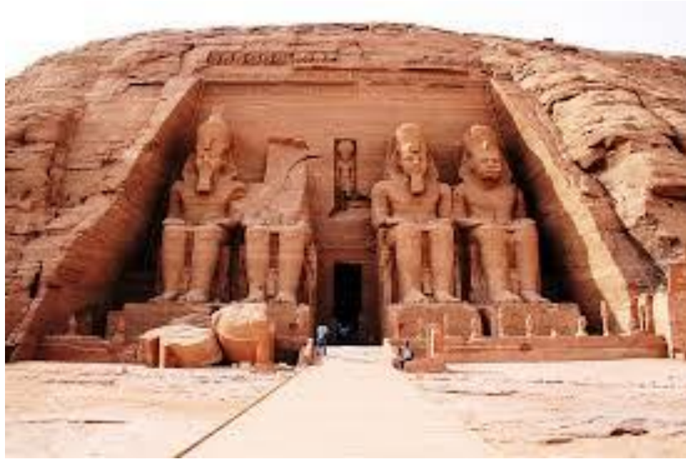
Abu Simbel temple

Breakfast in hotel, transfer to Aswan airport for departure to Abu Simbel, visit to Abu Simbel Temples (Great Temple of Ramesses II and Temple of Nefertari) , transfer to Abu Simbel airport for departure to Aswan. Meet and assist at the airport and transfer to 5-star hotel “Helnan Aswan”, overnight in Aswan.