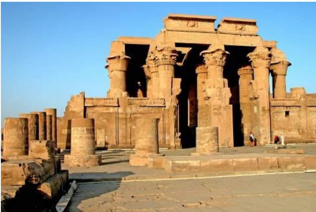
Double Temple of Kom Ombo