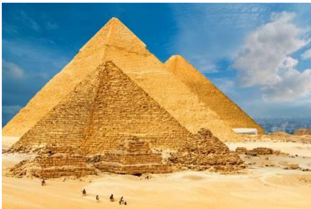
Magnificent Giza pyramids