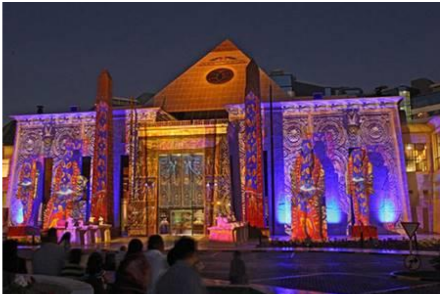
Philae Temple Light & Sound Show