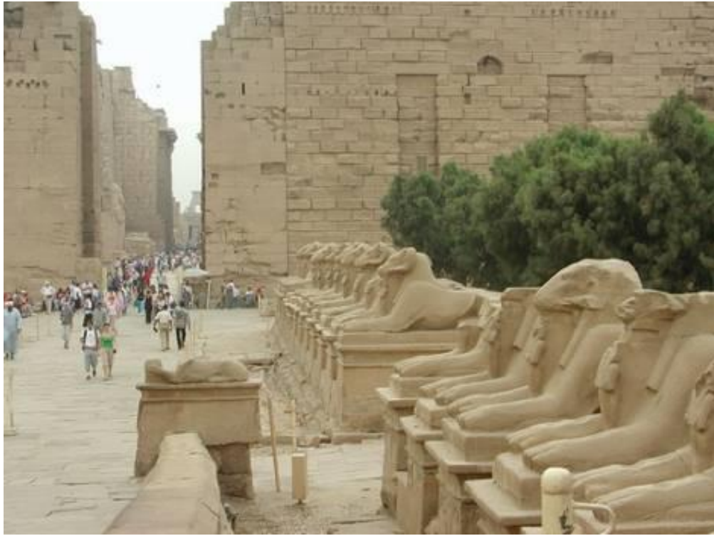
Temple of Amon-Ra in Karnak